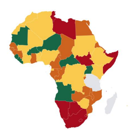
Figure 3. Map of AU Member States by hotspot level<sup>5</sup> on the PERC <u>dashboard</u>. This system is intended to highlight AU Member States in need of attention due to an increasing or widespread outbreak. For specifics on calculations, refer to the dashboard methodology.

The table below highlights changes in PHSMs by PERC hotspot warning level based on data from <u>Oxford COVID-19</u> <u>Government Response Tracker</u>. An up arrow indicates new PHSMs announced. The horizontal arrow indicates PHSMs extended. The down arrow indicates PHSMs loosened/expired.